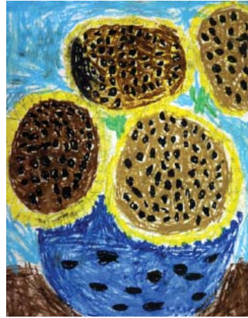
Art work by Lincoln-Titus ES student artists